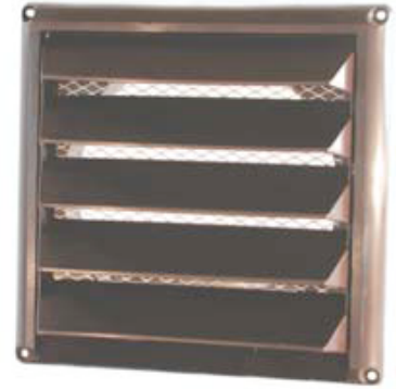
PA FIXED INTAKE LOUVER