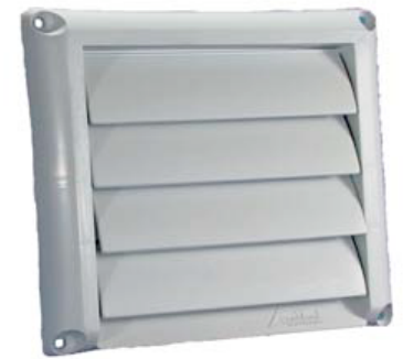
G MOVABLE EXHAUST VENT